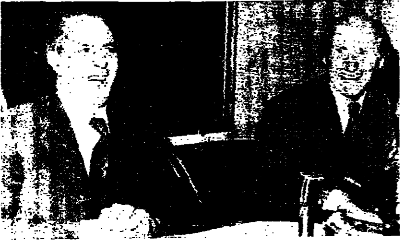
Britain's Chancellor of the Exchequer, Anthony Barber (right), and Social Services Minister Sir Keith Joseph in a cheerful mood yesterday as they explained to the press in London their suggested new "tax credit" personal tax system.